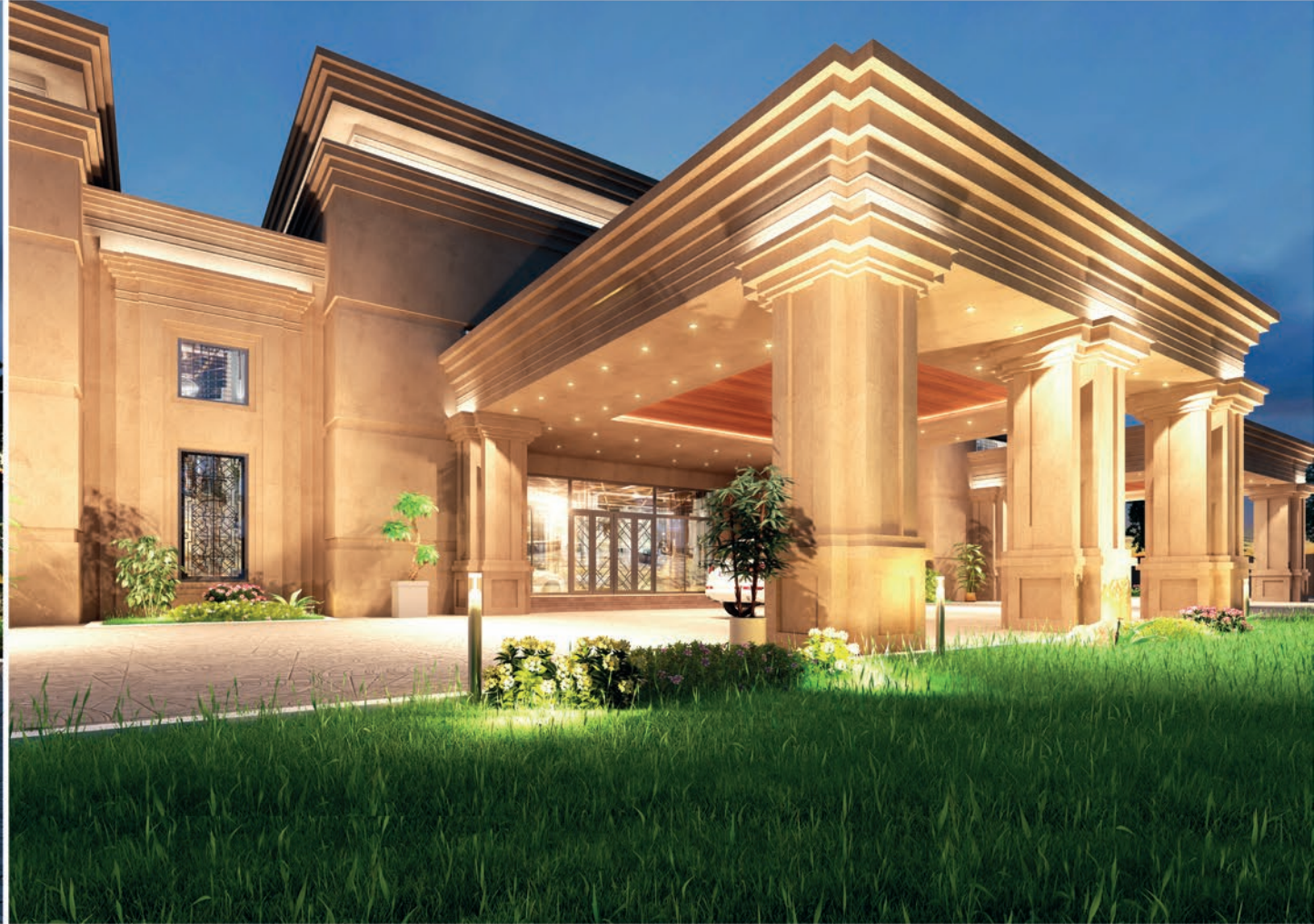
ELEVATION DETAIL Gulistan-E-Sehr Marquee