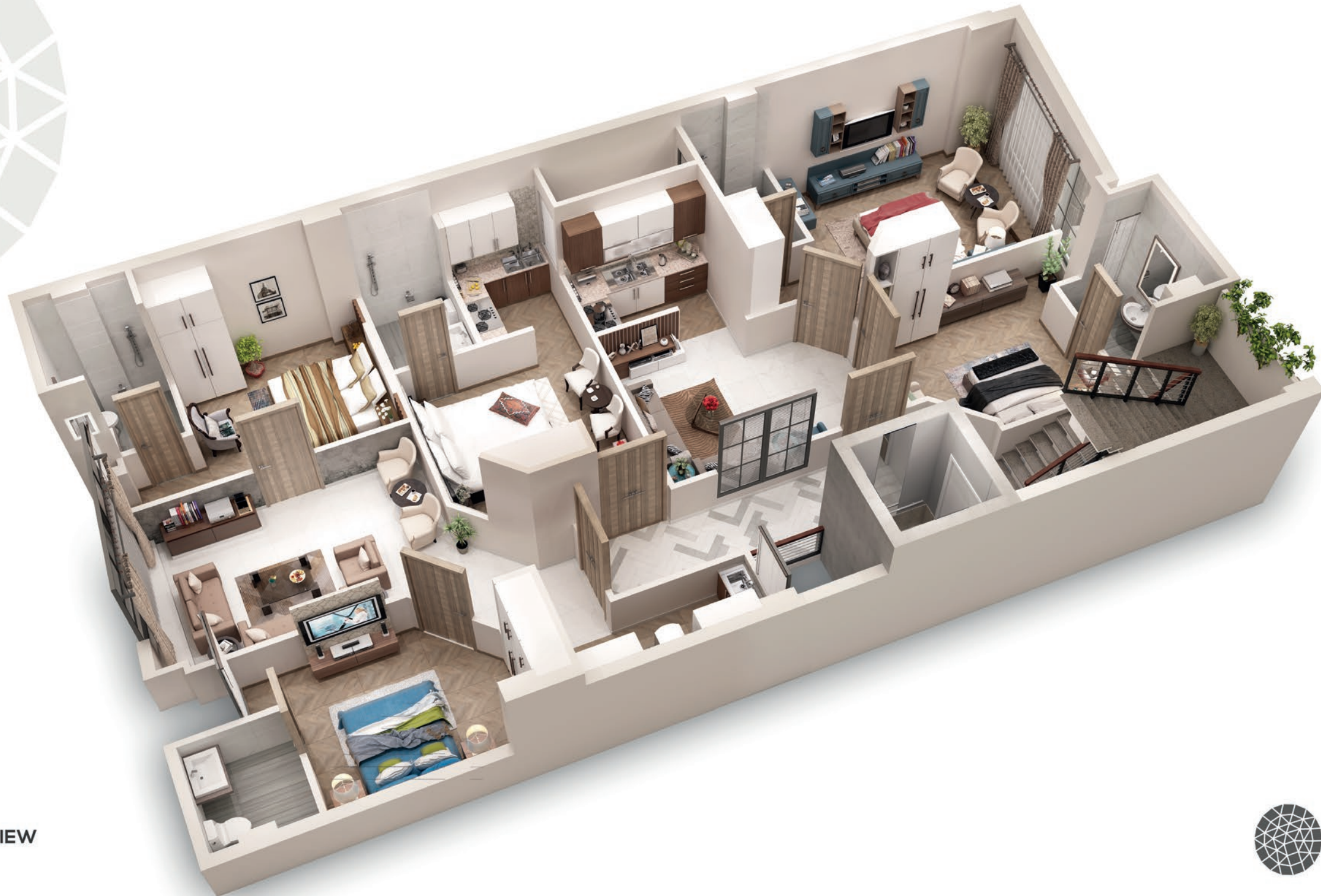
ISOMETRIC VIEW Ridge 29