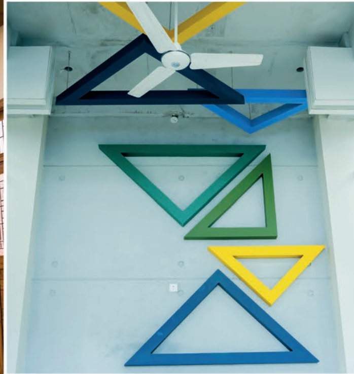
INTERIOR DETAIL Mukabbir College