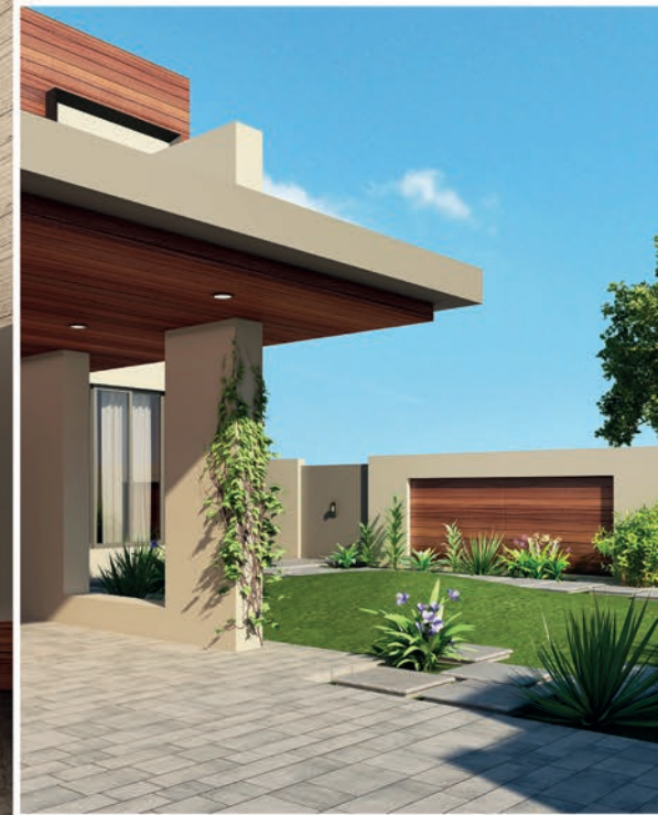
ELEVATION DETAIL Shezad Residence