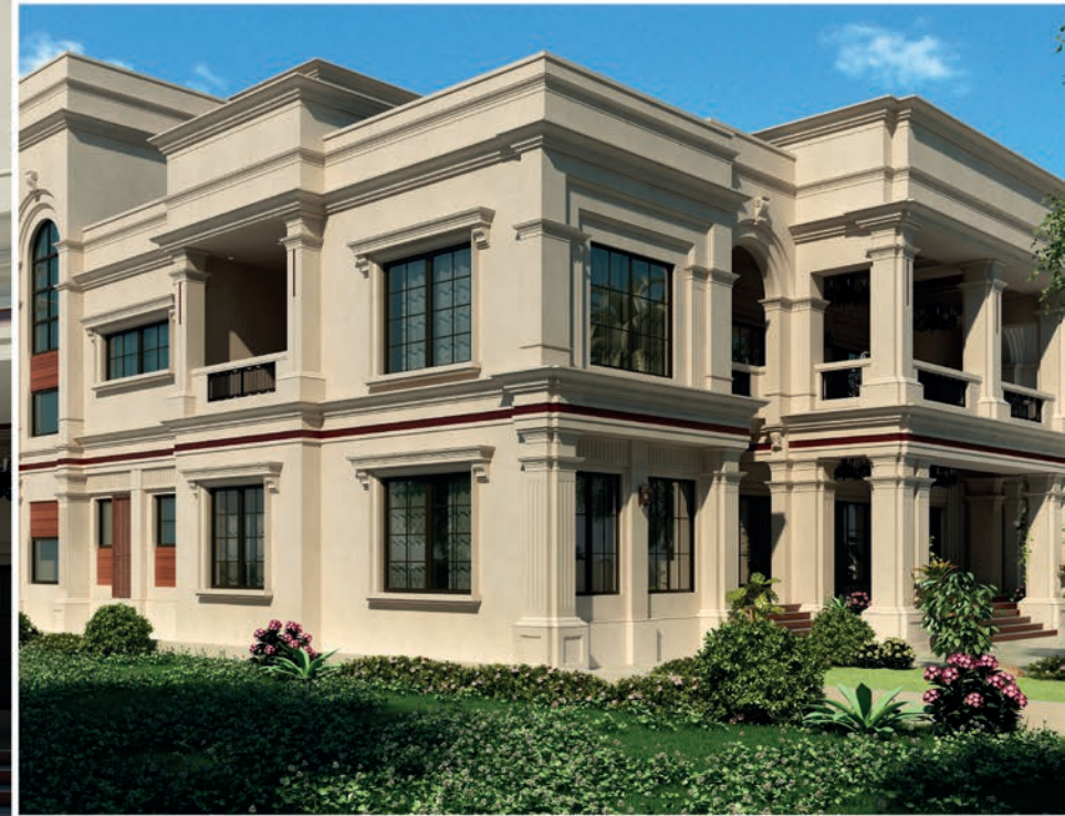
ELEVATION DETAIL Rehaniya Residence