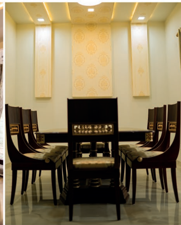
INTERIOR DETAIL Riaz Residence