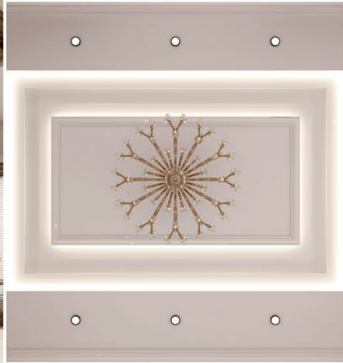
INTERIOR DETAIL Plasco Office