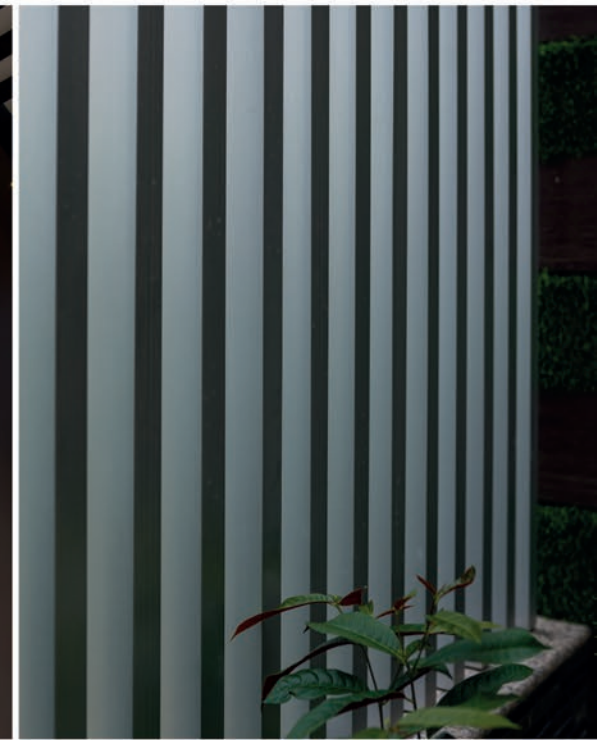
ELEVATION DETAIL Riaz Residence