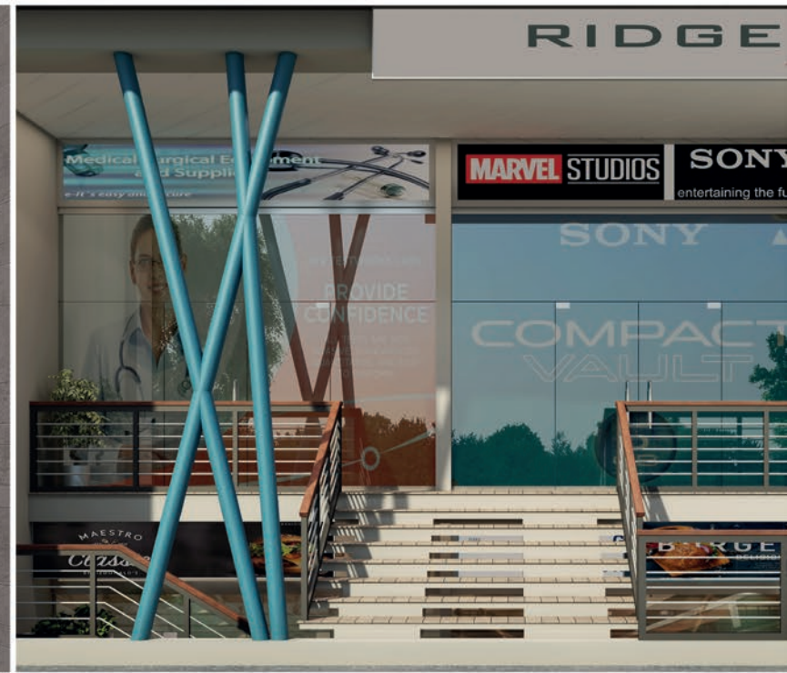
ELEVATION DETAIL Ridge 29