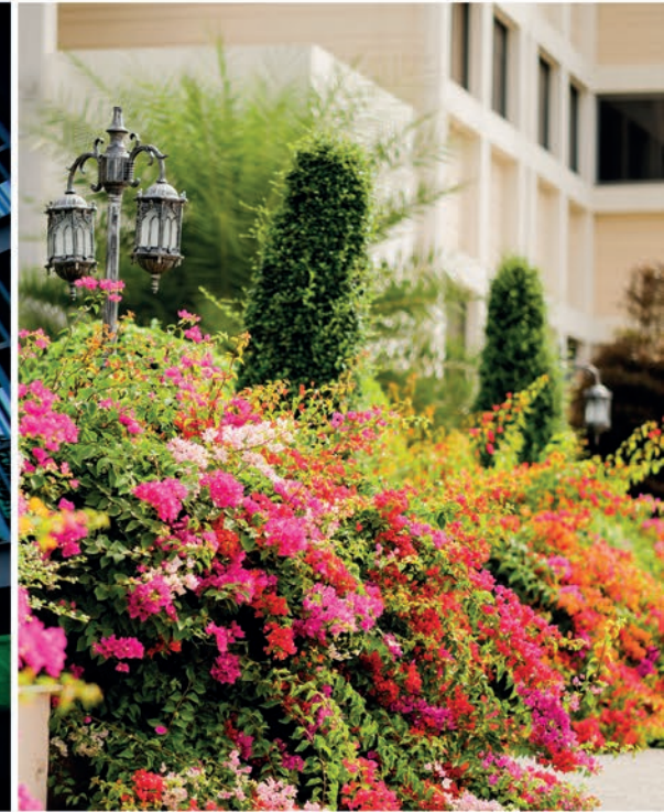
ELEVATION DETAIL Mukabbir College