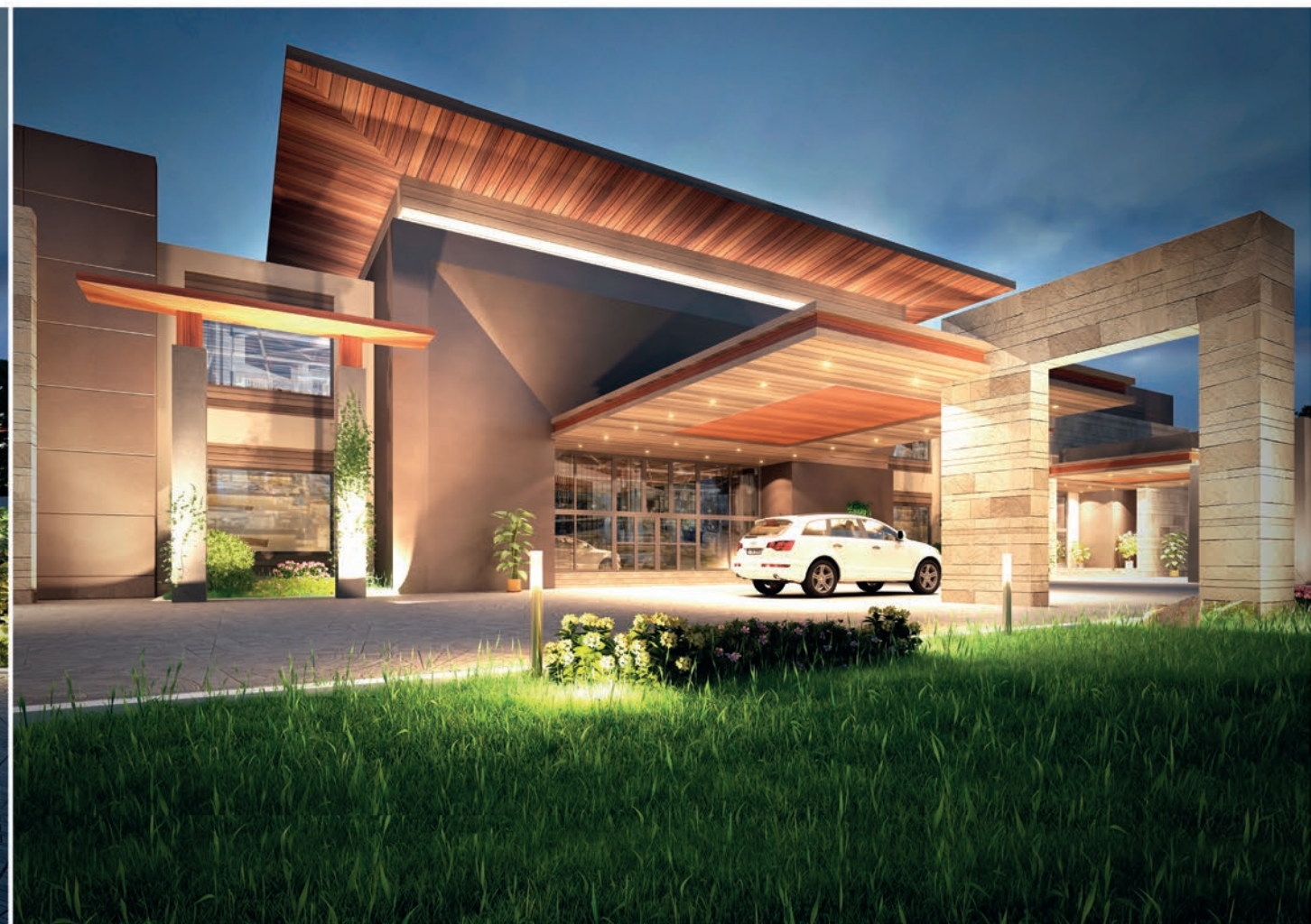
ELEVATION DETAIL Gulistan-E-Sehr Marquee