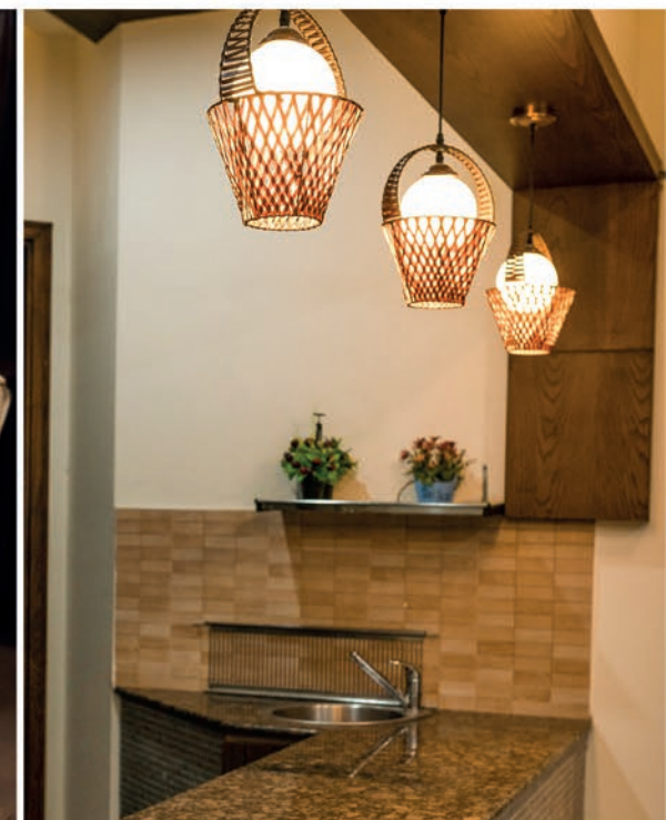
INTERIOR DETAIL Jahangir Residence