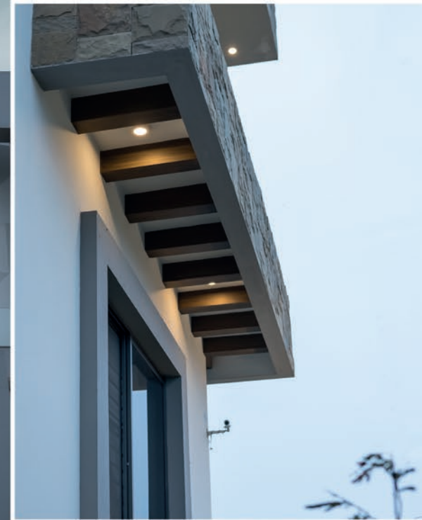
ELEVATION DETAIL Jahangir Residence