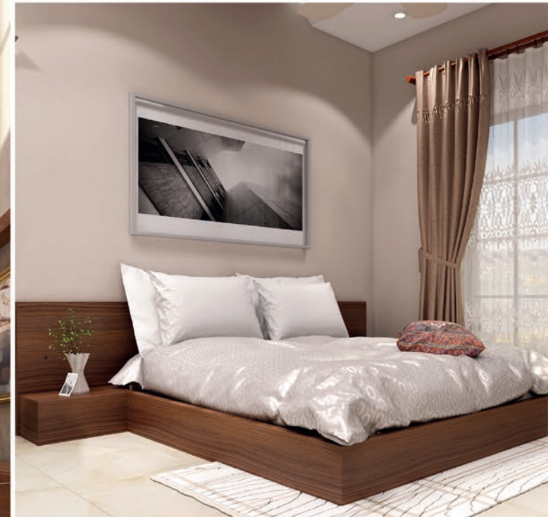
INTERIOR DETAIL Rehaniya Residence